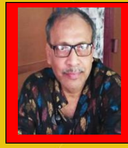
Dr. Jayanta Bhattacharya MBBS, Ph.D. Physician & Reviewer of the Bulletin of the WHO